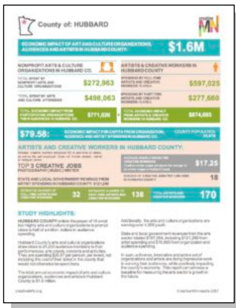
Hubbard County One-Pager Creative Minnesota, 2018 DOWNLOAD PDF